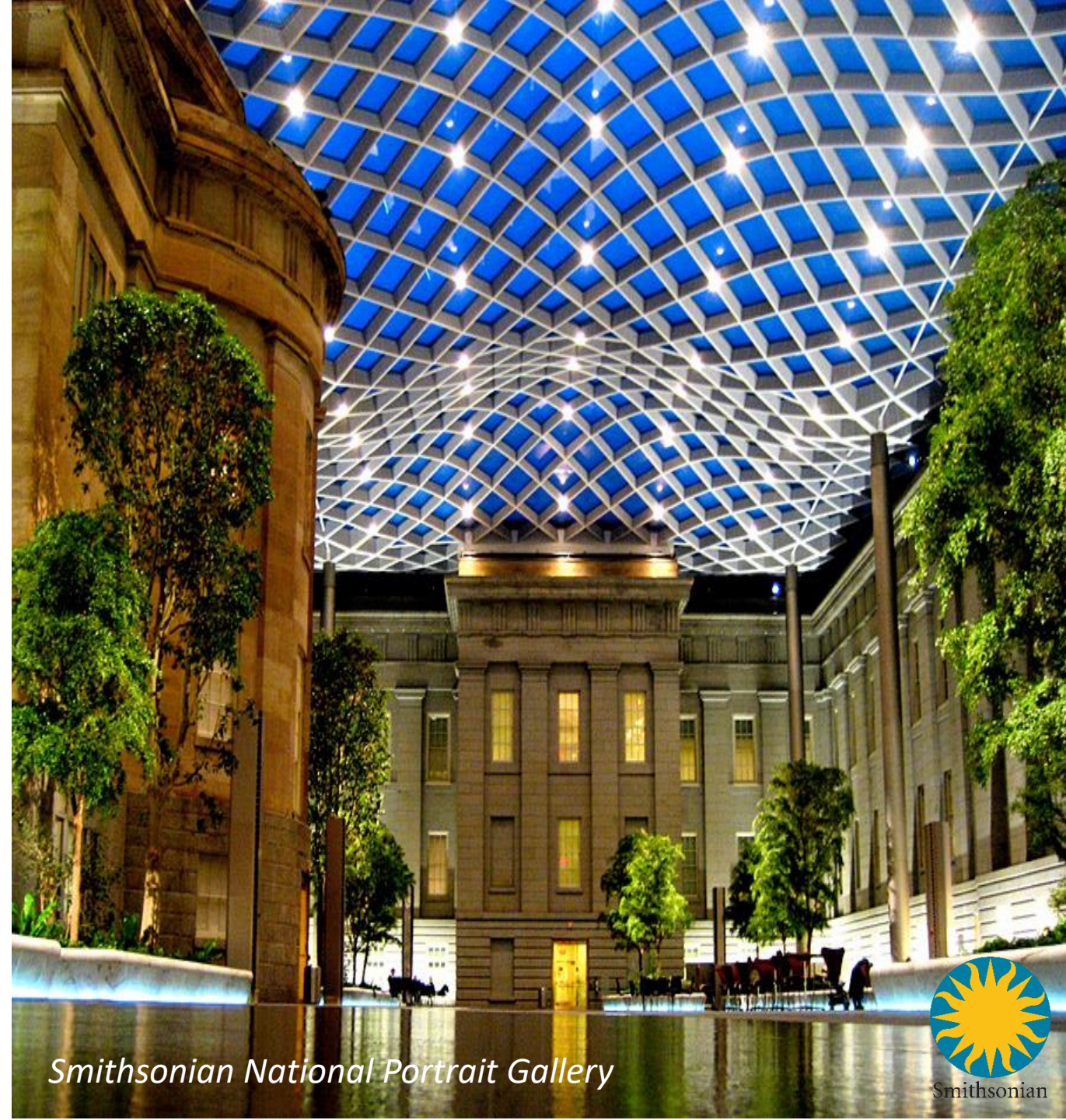
Smithsonian National Portrait Gallery