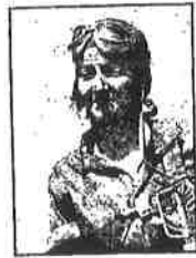
LEADER of WAFFs is Nancy Harkness Love.

IN Chicago, at the pilot training school of American Airlines, Inc., five young women, in-