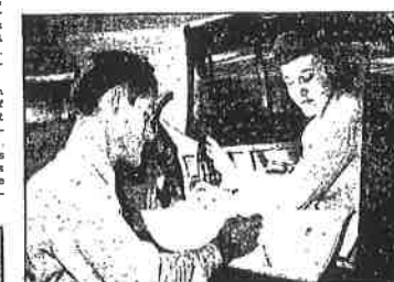
LINK TRAINER simulates real flight conditions, trains this girl to become an instructor herself.