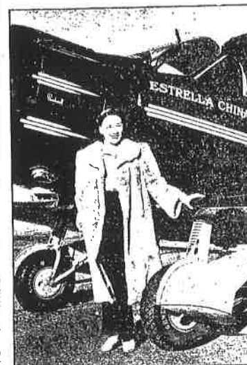
CHINESE AVIATRIX Lee Ya Ching typifies the air-mindedness of many women of her nation.