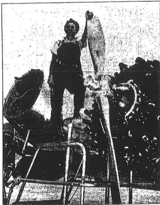
WRENCH WIELDER, first class, this girl mechanic is one of an all women maintenance crew that keeps 'em flying at Ellington Field, Tex.

Everyone has to admit they are doing a grand job. Perhaps even better than any soldier in uniform did. Women mechanics have been hired at Ellington Field before; but this is the first