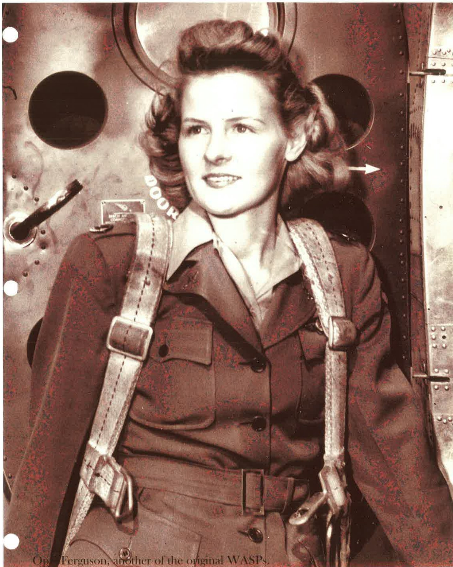
Op Ferguson, another of the original WASPs.