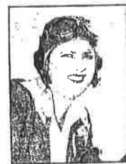
WAFFS are instructed by Jacqueline Cochran.

An all-woman maintenance crew at Ellington Field, Texas, expertly repairs damaged planes.