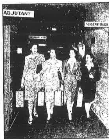
WAF RECRUITS, all civilian pilots, arrive at a training base to learn how to handle Army planes.

So that there will be women flyers to insure the growth of the WAFFS, the War Department started an experimental Women's Flying Training program. Miss Jacqueline Cochran was appointed director. She trains probable future WAFs at the Howard Hughes Airfield, Houston, Tex.