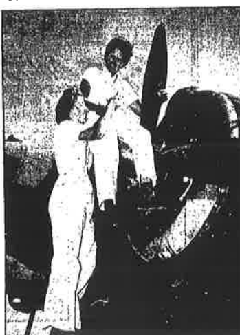
GIRL MECHANICS at Ellington Field, Tex., are filling the shoes of male "grease monkeys."