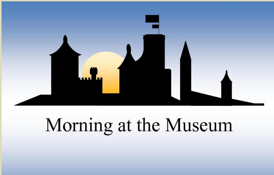
Morning at the Museum