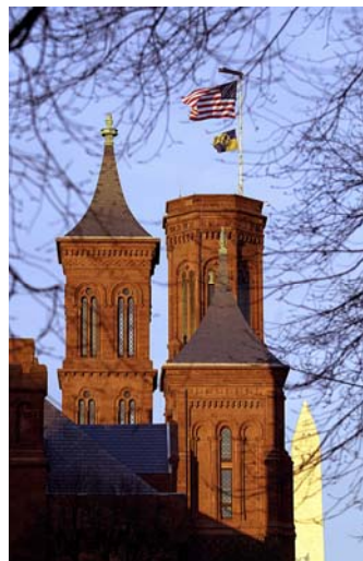
West-facing view of an early morning sunrise at the Smithsonian Institution Building ("The Castle").

The Smithsonian is the steward of an extensive collection. The total number of artifacts, works of art, and specimens in the Smithsonian’s collections is estimated at 156 million, of which 145 million are scientific specimens at the National Museum of Natural History. The collections form the basis of world-renowned research, exhibitions, and public programs in the arts, culture, history, and the sciences. The Smithsonian Affiliations program brings its collections, scholarship, and exhibitions to 46 states, Puerto Rico, and Panama.