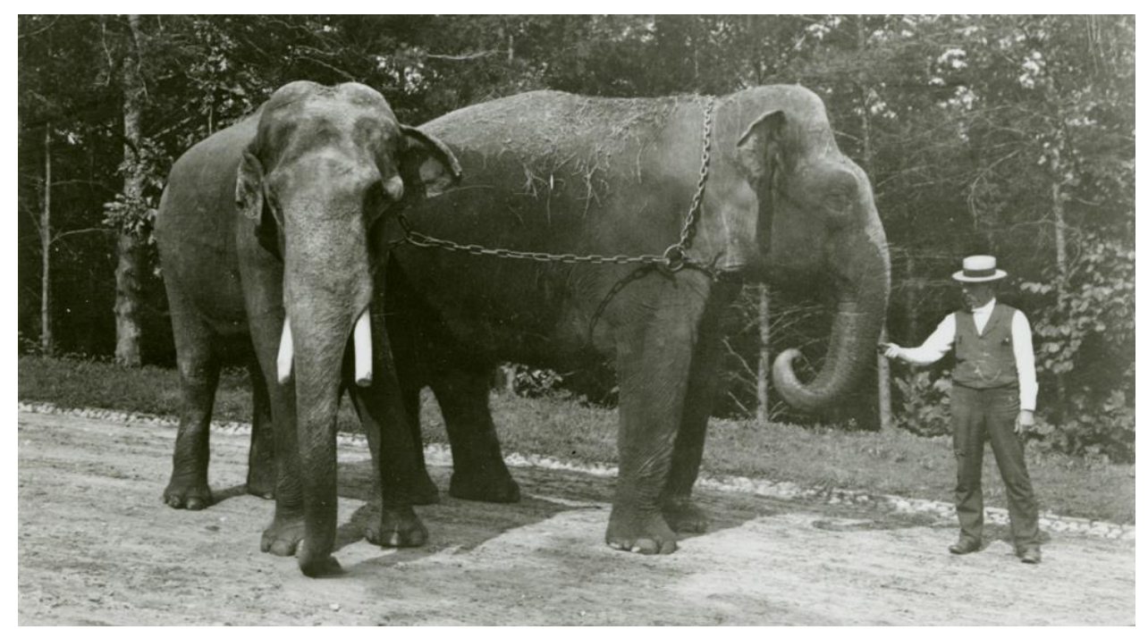
Dunk and Gold Dust out for a walk at the National Zoo, 1891

relationship increased the number and variety of exotic animals at the Zoo, and obviated the need for cash-strapped circuses to house and feed animals in the winter.