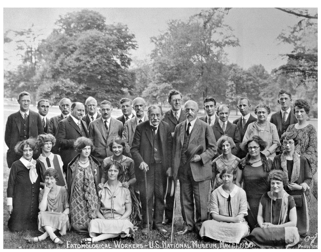
In 1925, entomological workers at the U.S. National Museum consisted of more curators paid by the U.S. Department of Agriculture than those paid by the museum

In the second half of the 19th century, several Federal agencies began to amass national collections: the Department of the Interior, the U.S. Fish Commission, the U.S. Department of Agriculture (USDA), and the U.S. Geological Survey (USGS), among others. The U.S. Army even had a physical anthropology collection. The Congress was concerned about providing funding for redundant collections. In supporting the Smithsonian as the National Museum from 1858 onward, Congress encouraged the Smithsonian to establish collaborative relationships with other Federal agencies that would allow the agencies easy access to the national collections at the Smithsonian. The 1879 statute creating the USGS reinforced this concern by making the Smithsonian the repository for all Federal collections. Thus, researchers from USDA, USGS, and