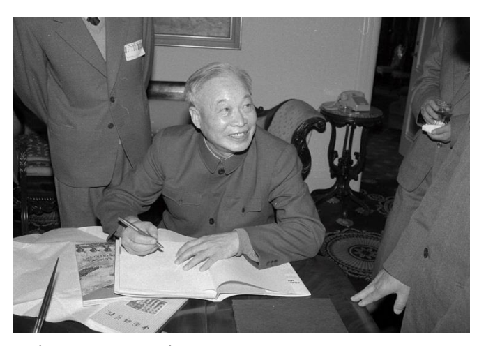
Chinese Vice President Qian Sanqiang signing an agreement on scientific cooperation between the Smithsonian and the Chinese government, opening the way for the exchange of scientific personnel and information, 1980

The Smithsonian has a long history of collaborative relations with foreign nations. Under extensive agreements with the nation of Panama, STRI has managed wildlife preserves, provided environmental education in exchange for access to the San Blas Islands and other facilities, and conducted environmental education in sensitive areas of the country. The Smithsonian also has worked with organizations from nations in limited contact with the U.S. State Department, such as the Cuban Academy of Sciences and the Chinese Academy of Sciences. On December 11, 1980, the Academy of