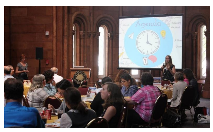
Smithsonian Affiliations Conference in the Smithsonian Castle, 2011

A long-standing relationship between the Smithsonian and other museums was formalized in 1996 with the creation of the Smithsonian Affiliations program, which today has 180 Smithsonian Affiliates in more than 40 states, Puerto Rico, and Panama. Affiliates represent the diversity of America's museums in size, location, and subject areas, and serve all audiences. More than 8,000 Smithsonian artifacts have been displayed at Affiliate locations.