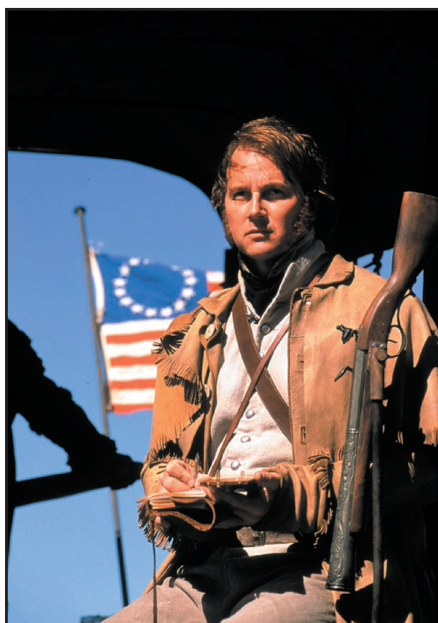
WILLIAM CLARK ON THE KEELBOAT