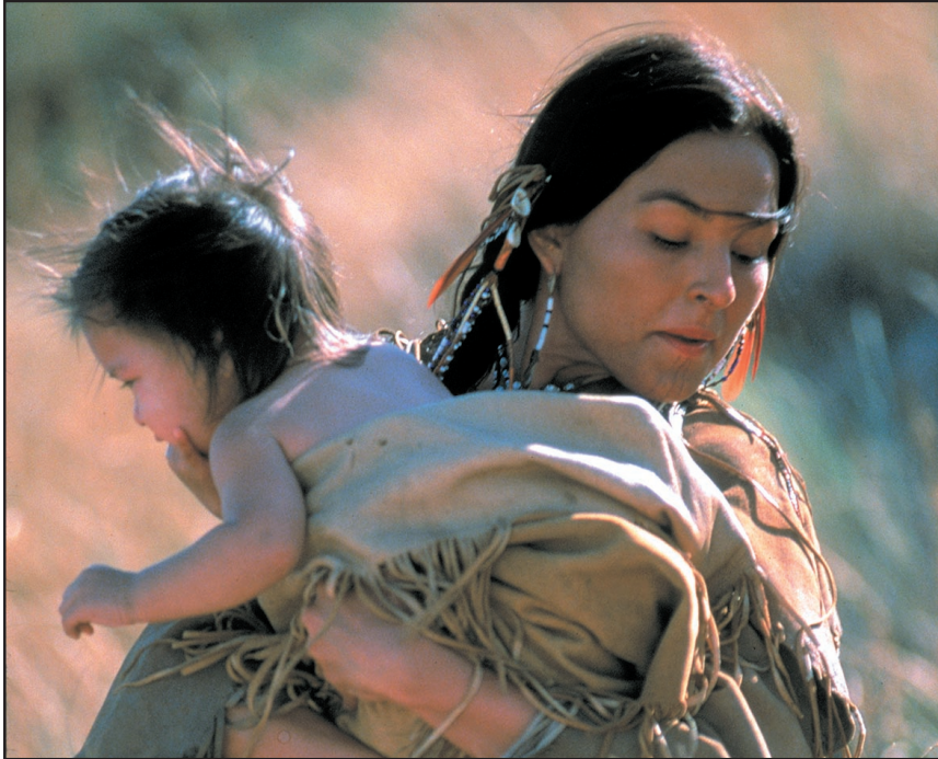
SACAGAWEA AND HER SON, JEAN-BAPTISTE CHARBONNEAU

Lewis and Clark met many different Native Americans on their journey. Most of them generously welcomed the expedition into their homes. Without their friendship and contributions, it is likely that Lewis and Clark would never have reached the Pacific Ocean or returned home safely.