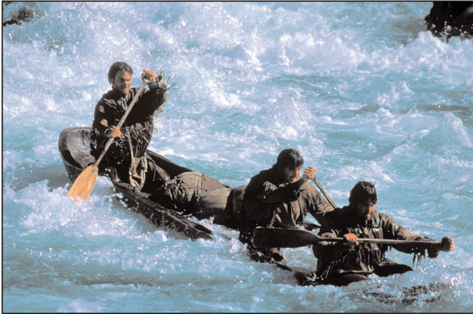
RUNNING RAPIDS ON THE COLUMBIA RIVER, BY JOHN LIVZEY © NGT&F

The Lewis and Clark Expedition was long and difficult. The group had to overcome many obstacles. They braved steep, snow-covered mountains. They suffered hunger, illness, and mosquitoes. The Corps of Discovery succeeded in reaching their goals by using problem-solving skills, determination, and perseverance.