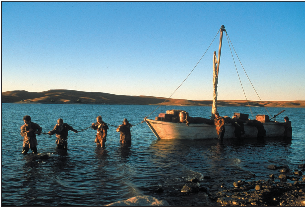
LEWIS AND CLARK PLANNING THE EXPEDITION'S ROUTE, (COVER) HAULING A PIROGUE, (ABOVE)

In 1803, President Jefferson commissioned Meriwether Lewis to lead an important expedition. His assignment: Find an all-water route to the Pacific Ocean, following the Missouri River as far as possible, and map uncharted areas of western North America. Lewis and his co-captain, William Clark, planned for the journey for months, but because they had no idea what to expect, it was hard to decide what to take.