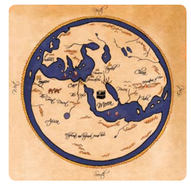
Re-creation of 1154 world map by Arabic cartographer Muhammad al-Idrisi.