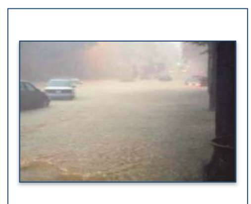
Street flooding in Washington during the Flood of August 11, 2001.

The Smithsonian has experienced numerous large-scale weather-related emergencies in the recent past. In 2006, the Washington, DC area experienced an historic rain event that closed some federal agencies (e.g., the IRS and National Archives, etc.) for months. Only a few Smithsonian museums required closure, and at most for only several days. The Institution successfully protected its staff, visitors, and collections during the destructive winds of the June