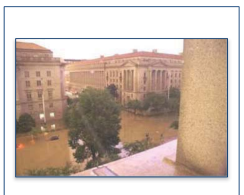
Constitution Avenue, NW, near the National Museum of Natural History.